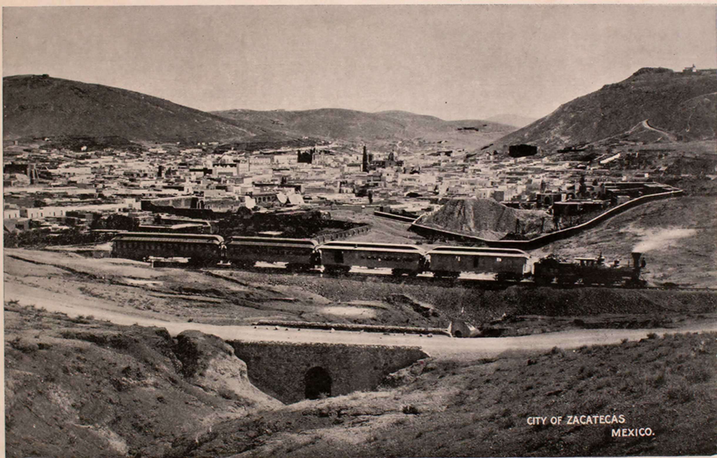
CITY OF ZACATECAS MEXICO.