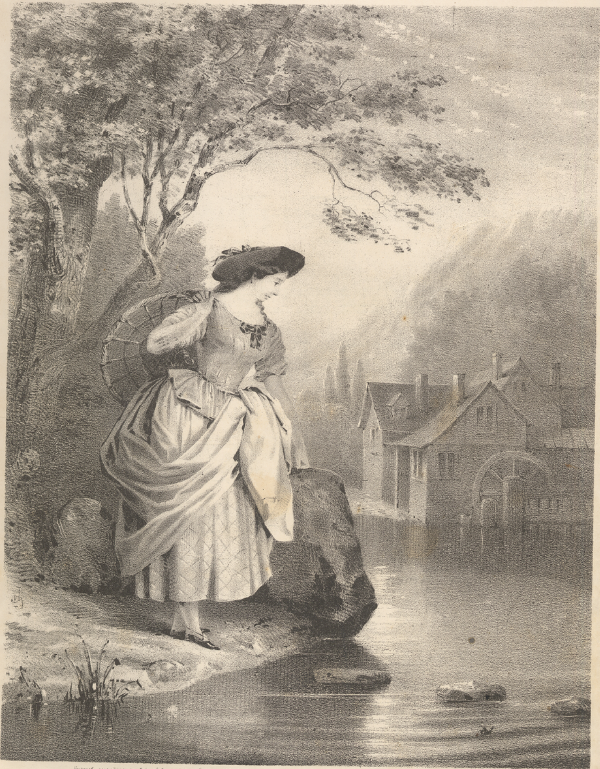
Entered according to Act of Congress in the year 1859 by W. G. Peters & Sons in the Clerk's Office of the District Court of the Southern District of Ohio.