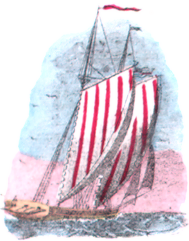
Vessels of the Land of Steady Habits.